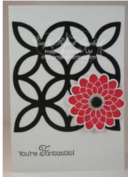
Note Card 2